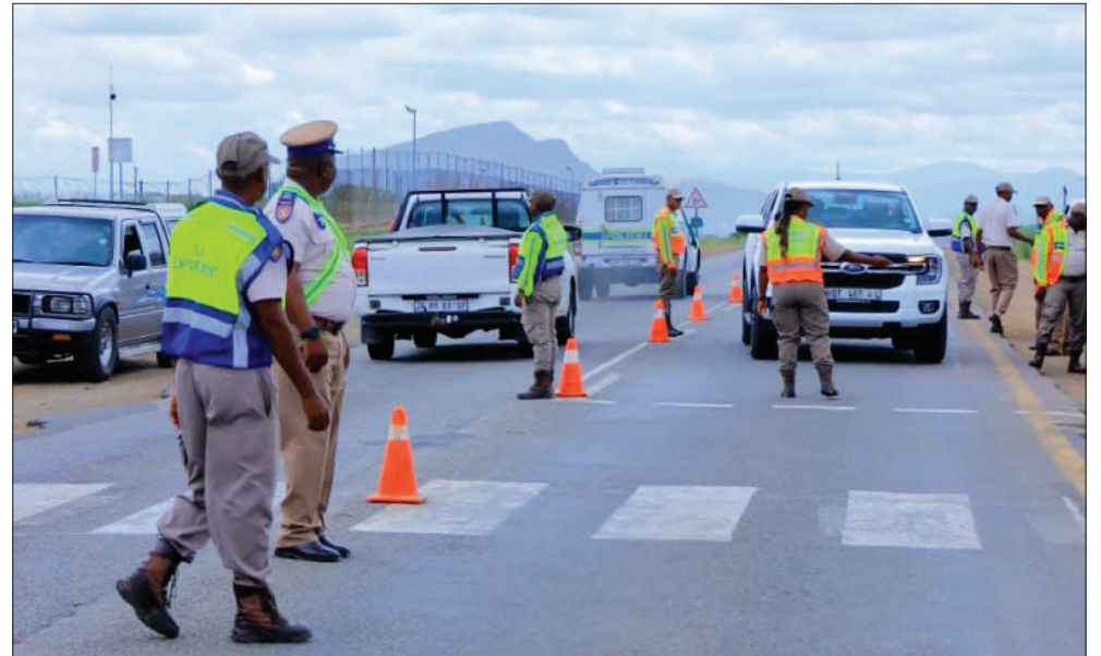
Traffic officers conducting a mini roadblock on the R37 Road along Ga-Manyaka Village as part of the Road Safety campaign organised by Sekhukhune District Municipality.

GA-MANYAKA - Members of the public were empowered with road safety tips in Ga-Manyaka Village at the local community hall last Thursday during Sekhukhune District Municipality's Road Safety campaign ahead of the Easter Holidays.