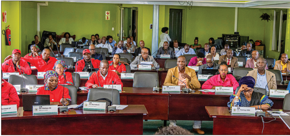
A special council sitting of Makhuduthamaga Local Municipality at the municipal chamber in Jane Furse.

JANE FURSE - In move to regulate the rising local economic activities and plan new projects and programmes, Makhuduthamaga Local Municipality (MLM) passed its draft Township Economy By-law, Integrated Development Plan (IDP) and budget for the 2025/2026 financial year during a special council meeting held on 31 March.