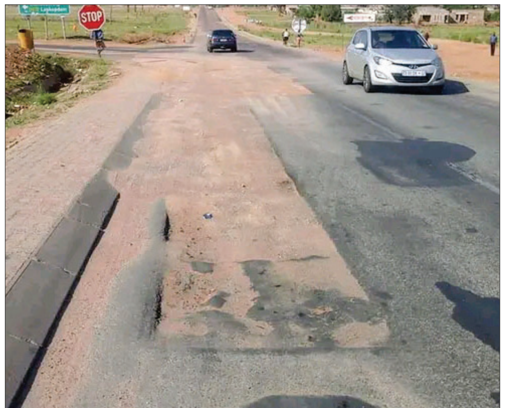
The poor state of R25 Road has sparked outrage and fears for safety from motorists.