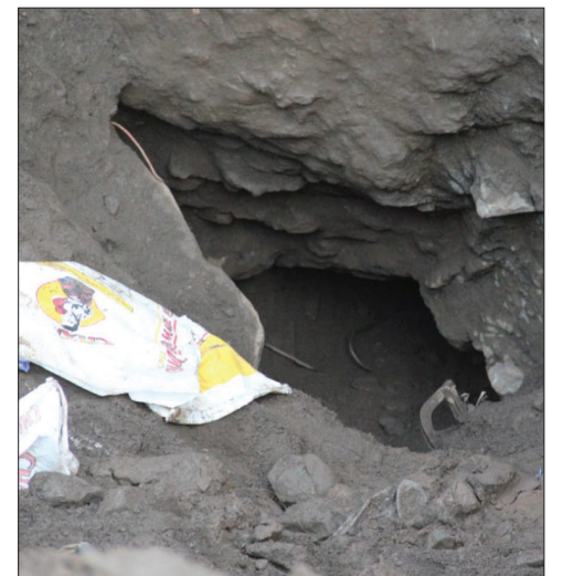
Two Zimbabwean miners were recently sentenced for illegal mining.

The court heard that on 7 May 2024, police conducted an operation at Atok Village and noticed two men busy mining illegally at Machakaneng Section. The police tactically approached the suspects and found them using a jackhammer and generators. The suspects were searched and found without