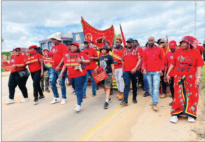
Scores of EFF members and supporters on their way to deliver a memorandum in demand of improved healthcare services at Jane Furse Hospital.