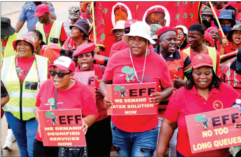
Scores of EFF members and supporters on their way to deliver a memorandum in demand of improved healthcare services at Jane Furse Hospital.