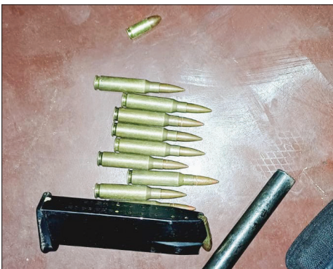
Some of the drugs and firearms with ammunition confiscated during the arrest of suspects in various locations within Sekhukhune district.

The other arrested suspects are expected to appear before the respective court in Dennilton, Siyabuswa and Sekhukhune for possession of unlicensed firearms and ammunition, possession of drugs and other serious charges.