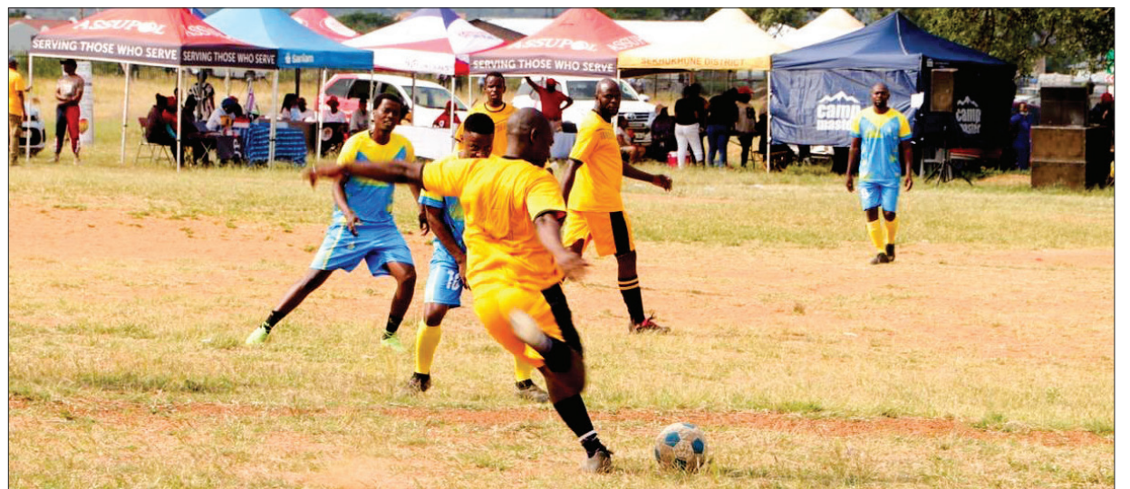
Soccer was among sporting codes featured during the MLM Employee Wellness Sports Games held at the Marishane Sports Complex.