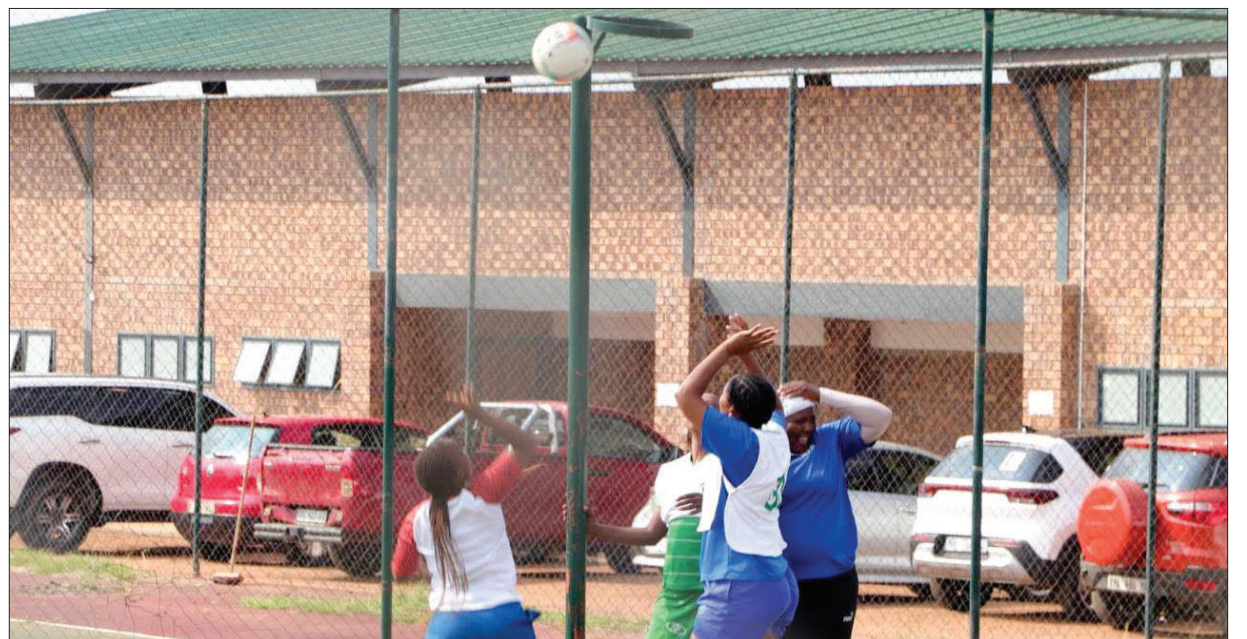
Netball sporting codes mesmerized the spectators during the Makhuduthamaga Employee Wellness Sports Games.